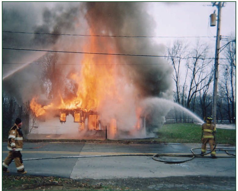
Firefighters from the Dexter Area Fire Department used the Library's properties on Alpine Street for training.