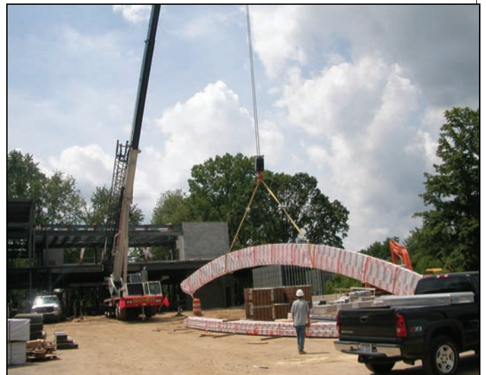
Earlier in the summer, crews hoisted the curved roof beams into place on the second floor.

Due to the ever-present pile of soil on the Alpine Street level, the work to place the utilities underground is just beginning. Conduit has been placed underground for the major utilities. In the coming months, DTE Energy, AT&T and Comcast will take down the poles at the