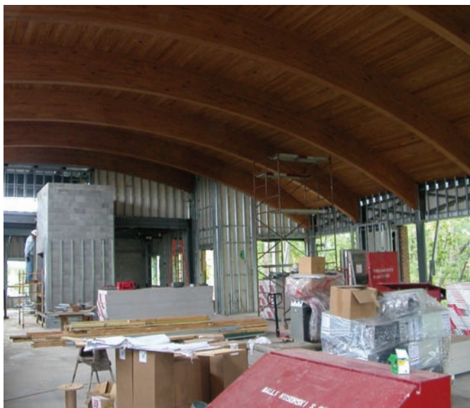
The second floor main reading room takes shape. The wood roof was installed over the summer.