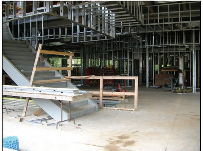
Installation of the main staircase, and interior framing for the first floor continued through the summer months.

Inside the building, the progress has been amazing. The mechanical infrastructure for air handling, plumbing and electrical is near completion.