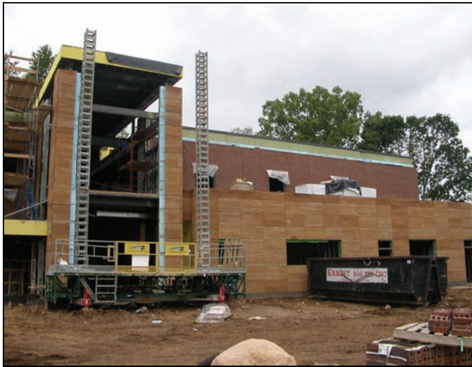
The exterior masonry nears completion at the end of the summer.

street and run their utilities underground to the building. The building has also been connected to the Village water system.