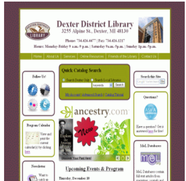
The Library's recently redesigned web site offers a variety of new links, reorganized information and clearer search paths to Library related information.

The Library is expanding its offerings of online databases available to the public. Please see Page 3 for more details on information resources available in the Library and at home.