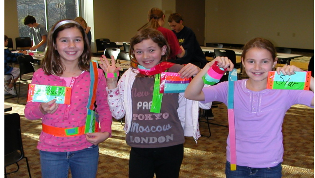
Teens enjoy the Library's Duct Tape workshops!